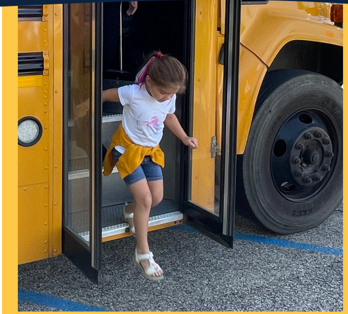
Little Feet, Big Steps -incoming kindergarten students across the district took part in bus orientation training today.

School Supplies for Students in Need - Mooresville Schools' families who need assistance with school supplies may stop in to pick up necessary items from Family Services.